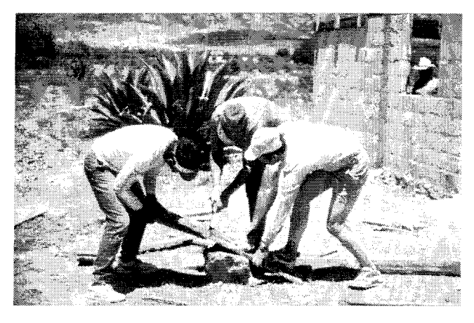
Fig. 5. Mexican, Russian and American workers cut formwork for the HfH house under construction behind them.

Discussions prior to departure focused on cultural differences and the nature of the construction effort. The first week in country included presentations on the politics and customs of the region and several days in Mexico City (during which time the architects visited many of Luis Barragan's works). This was then followed by 4 weeks of construction.