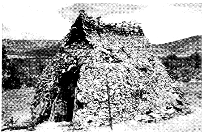
Fig. 4. Traditional dwelling of the Otomi Indians. Students worked to replace these with more substantial construction.

'Peaceworks' makes available organized volunteer projects in many countries. One in particular, and used in this case study, was in the Mezquital Valley, near Ixmiquilpan, Mexico. This is a high desert valley, 2.5 hours north of Mexico City. The new homes would replace indigeneous structures made from the leaves of the Mesquite plant. This