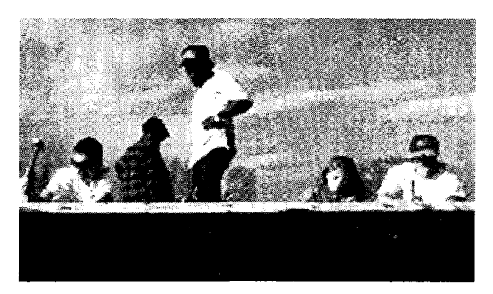
Fig. 1. Students completing sub-roofing on a Habitat for Humanity house.

In many schools of architecture, 'Materials and Methods' and 'Construction Technology' courses routinely engage students in hands-on experiences. These materials handling and rudimentary assembly exercises often serve to inform the student only in the most simplistic and superficial aspects of skills that are far more complex and demanding than the experience allows. In many cases, the activities employed in these courses are reminiscent of high school.