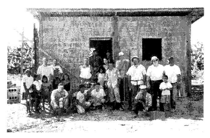
Fig. 6. Participants pausing upon completion of one house before moving onto build another in Honduras.

Upon return, the students presented their slides, photographs and sketches. They also had several seminar discussions about contrasting cultures. The students gave their sketch books to local children and at least one parent for an hour or so, to allow them to record their thoughts visually. The students then talked with them about what they had