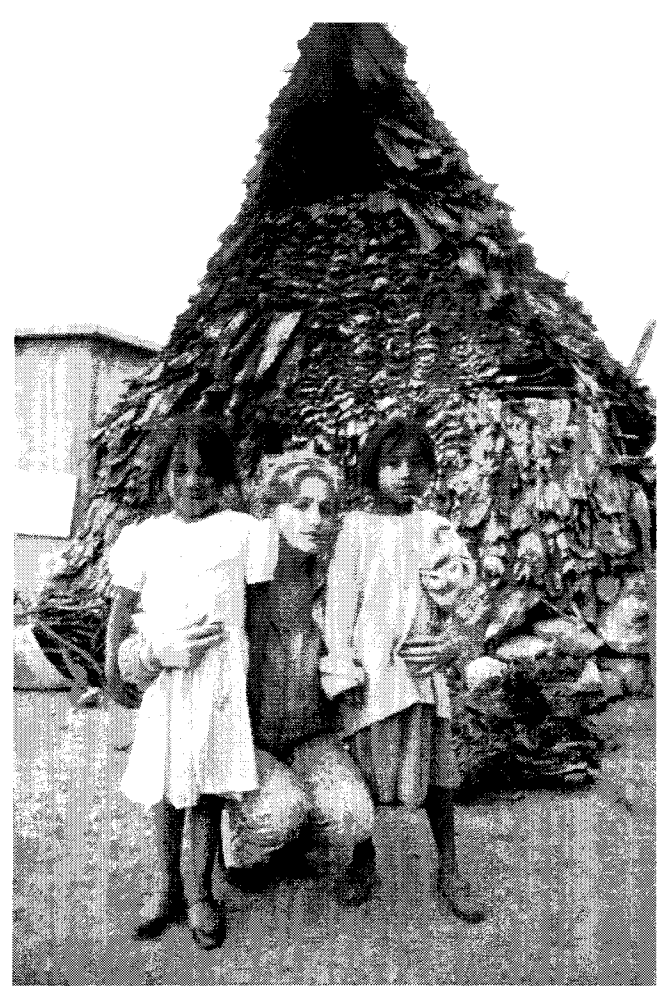
Fig. 8. The cultural interchange dimension for the Practicum student is both comprehensive and immediate. In the background are both the traditional and recently completed Habitat for Humanity, student constructed dwellings.

sensitive manner...It is an increasingly difficult task, requiring continual development of our ethics, knowledge, sensitivity, and problem-solving skills." (7)