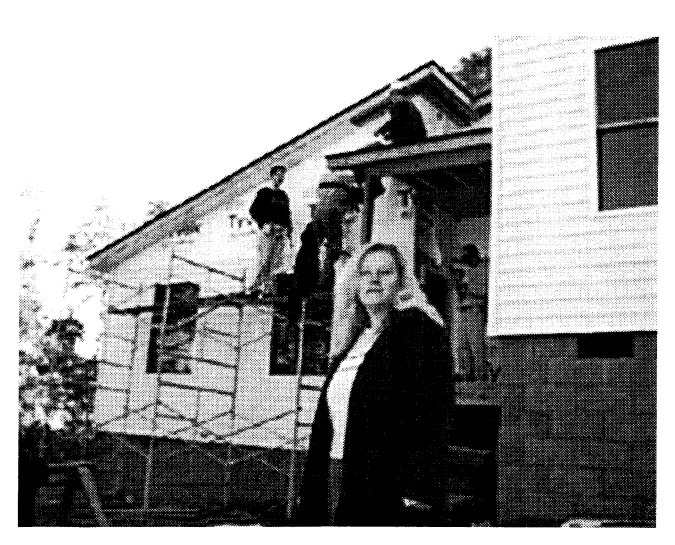
Fig. 3. Habitat for Humanity homeowner in front of the house designed by and being constructed by architecture students.

Desire and energy alone will not make either a knowledgeable or physical contribution to the environment. Devoid of knowledge, desire and energy are admirable but unproductive traits. However, when activated with knowledge and focused intent, they can be highly productive. The practicum approach provides the student with necessary intellectual support as well as a forum for action. In combination, the student begins to know and understand service to society in a professional context. The following case studies, one regional and three international, demonstrate the multicultural interaction and benefits of infield experience in the service of others.